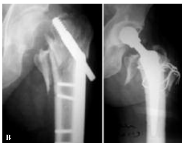
Fig. 3. — A : 72-year-old man with poorly fixed intertrochanteric fracture. B : secondary hip replacement with good result at 40 months. There was persistent mild pain over the greater trochanter.

Heterotopic ossification was found in 8 hips (29.6%) out of 27 : five were type I, one was type II and two were type III according to Brooker's grading.