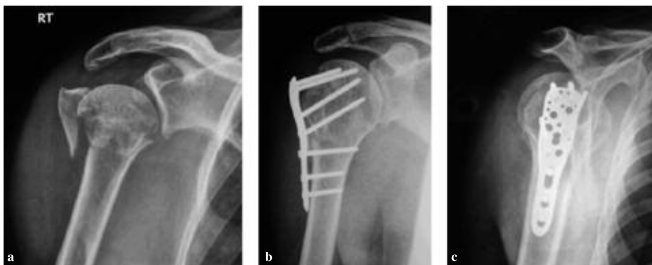
Fig. 2. — a : Preoperative AP view of a three-part proximal humeral fracture ; b & c : postoperative AP and lateral view of the same patient after fixation with a PHILOS plate.