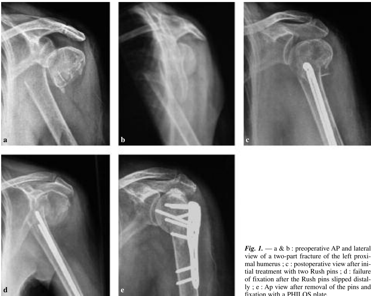
Fig. 1. — a & b : preoperative AP and lateral view of a two-part fracture of the left proximal humerus ; c : postoperative view after initial treatment with two Rush pins ; d : failure of fixation after the Rush pins slipped distally ; e : Ap view after removal of the pins and fixation with a PHILOS plate.

58) and DASH score of 31.5 (range 0 to 87.1). The only patient who did not progress to full union declined further surgery as she felt that she was able to perform all activities necessary for daily living without undue discomfort.