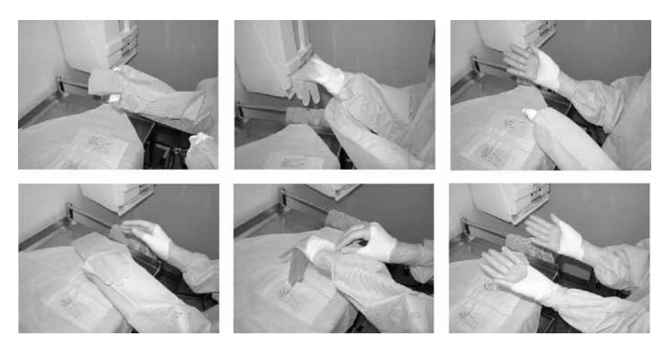
Fig. 3. — Closed glove donning technique

increased understanding of bacterial contamination sources, infection following joint replacement surgery continues to be a problem. The rate of deep wound infection is reported as less than one percent following joint replacement, which represents a significant number of affected individuals considering that a total of 77,233 hip and knee arthroplasty procedures were performed in the NHS in 2005 (10). In addition, the cost of revision surgery, which is on average 30% greater than that of a primary procedure (1), can pose a substantial economic burden on the state. Postoperative infections therefore expose the NHS to considerable but potentially avoidable financial demands.