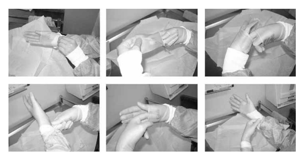
Fig. 2. — Open glove donning technique