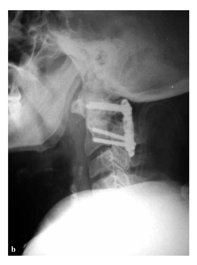
Fig. 2. — a. Sagittal MRI-scan showing circumferential cord compression C1-C2 in a patient with rheumatoid arthritis; b. Post-operative lateral radiograph showing the C1 lateral mass screws/C2 pedicle screw plate technique (Goel) with complete reduction of the atlantoaxial articulation.

follow-up period was 25.1 months (range 24-28 months).