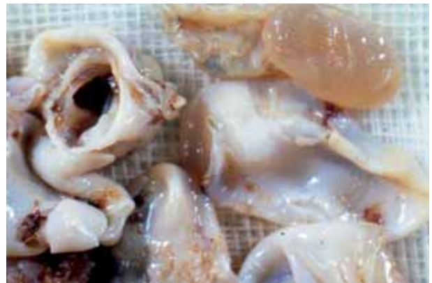
Fig. 2. — Photograph of the resected hydatid mass

herniation, was admitted to the hospital with increasing back pain and bilateral radiculopathy.