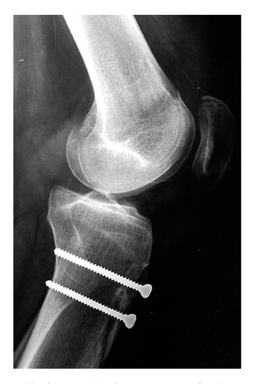
Fig. 2. — Patella after transosseous fixation

However two months postoperatively the patient slipped with acute hyperflexion of his operated knee. He presented at the emergency room with haemarthrosis, extension lag and a palpable defect in the proximal extensor mechanism. The standard radiograph demonstrated a proximal patellar fracture. Internal fixation was proposed to the patient. The proximal patellar fragment was exposed through the previous lateral release. On exploration the vastus medialis obliquus was still attached to the upper medial quadrant of the patella. A small portion of the articular cartilage was attached to the