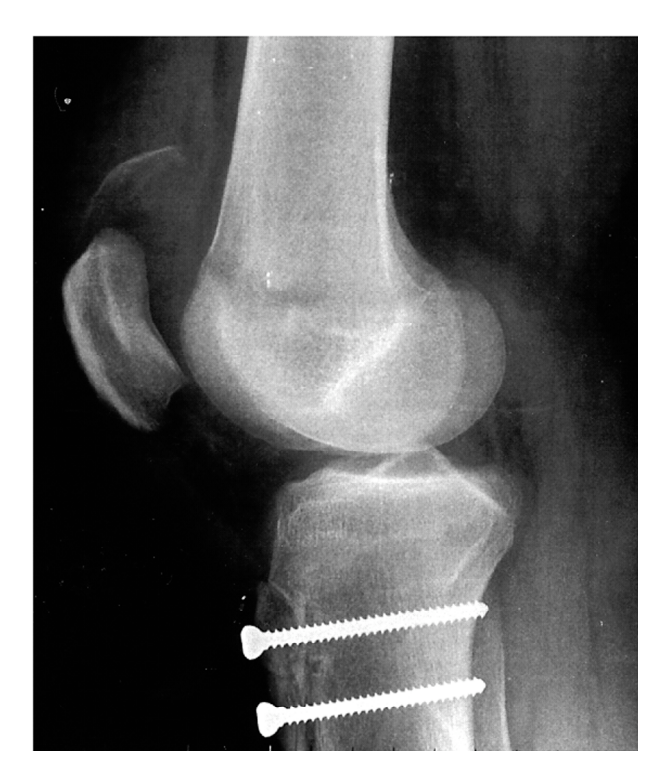
Fig. 1. — Proximal patella avulsion fracture

Insall (7). With this technique the medial patellotibial ligament is also released, sacrificing both medial genicular arteries. Additionally a Fulkerson osteotomy with correction of the Q-angle was performed (4). The osteotomy site was rigidly fixed with two compression screws. Excellent patellar tracking and stability was achieved. A standard postoperative protocol was followed with bracing, continuous passive motion, partial weight bearing and isometric quadriceps exercises. At six weeks follow-up, an excellent evolution was observed.