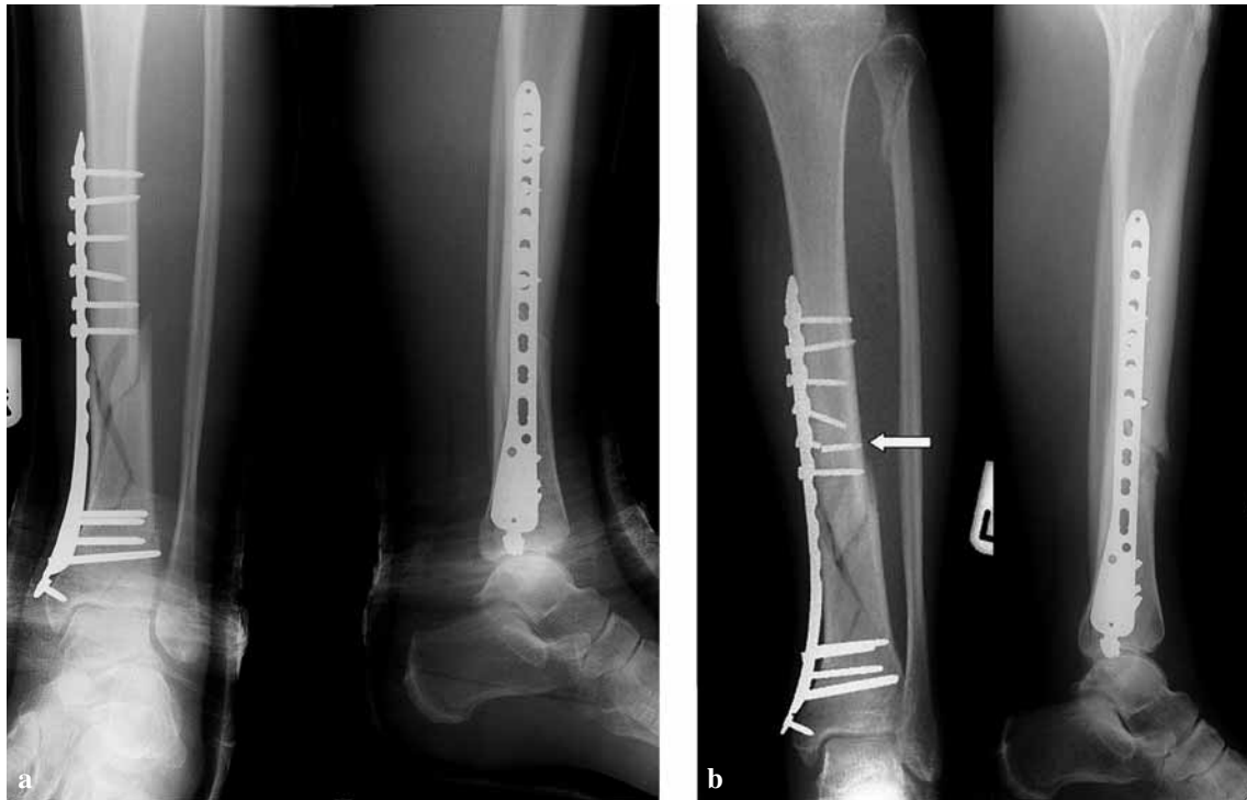
Fig. 3. — Radiographs of the patient who presented a fracture of one proximal screw. Comparison (a) before hardware failure (b) after hardware failure. The overall tibial alignment is maintained.

recognise the importance of the soft tissue component (13). Failing to appreciate the soft tissue condition will invariably complicate the injury with infection, wound dehiscence or non union. Where the soft tissue injury is significant, bridging external fixation is advantageous for skeletal and soft tissue stabilisation (19). Definitive fixation is only advisable when the soft tissue allows it, when the 'wrinkle sign' is evident.