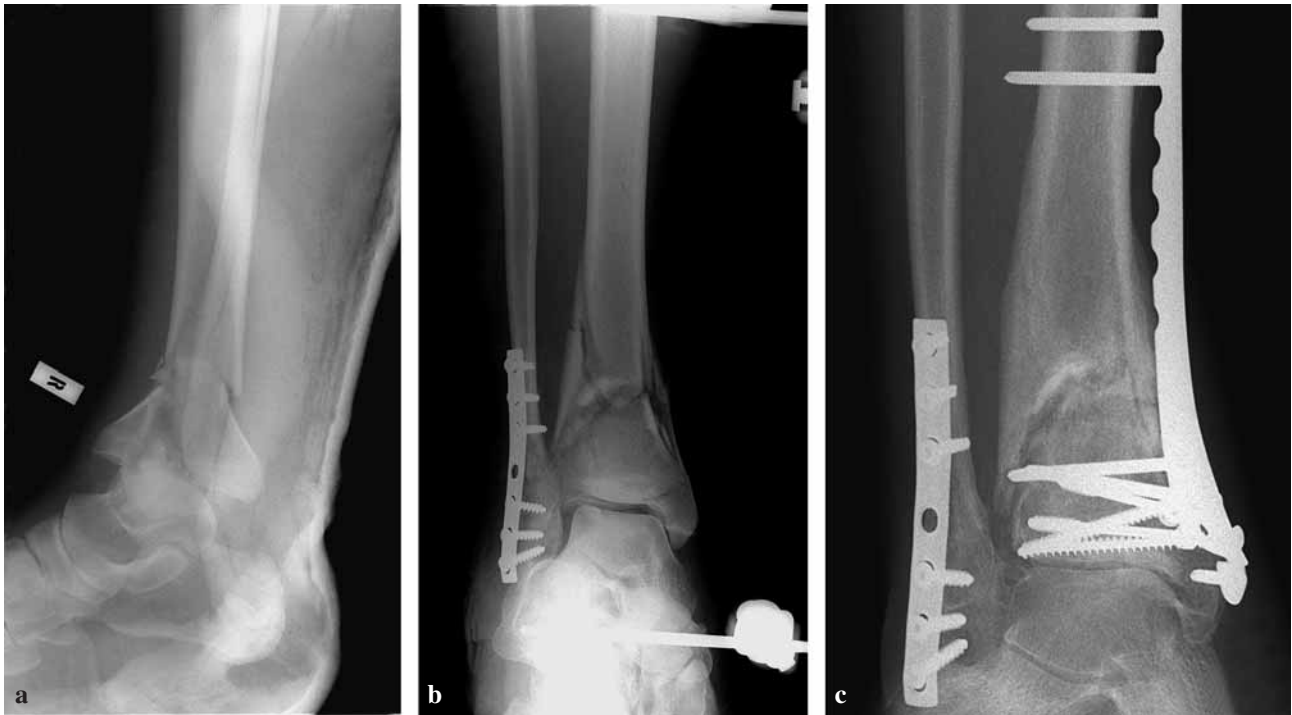
Fig. 2. — (a) Pilon fracture of distal tibia, preoperative radiograph ; (b) Temporary bridging external fixator for soft tissue and skeletal stabilisation. ORIF fibula performed when soft tissue swelling was acceptable ; (c) Postoperative radiograph. Mature callus formation over the fracture site.

Orthopaedic Foot and Ankle Score (AOFAS), SF-36 score, time back to work and change of work in relation to the injury were used to assess the functional outcome.