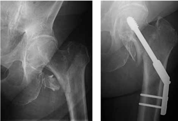
Fig. 1 & 2. — AP radiograph of the left hip showing the fracture of the proximal femur before and after internal fixation with a DHS.