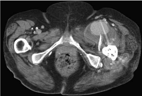
Fig. 3. — CT scan showing a pseudoaneurysm of the profunda femoris artery caused by a bony fragment from the lesser trochanter, with haematoma.

tion she complained of persisting pain in her left inguinal region, while X-ray investigation showed no explanation for complaints. Pain was present on weight bearing and walking. On inspection, no abnormalities were visible and on physical examination of the left thigh a palpable non pulsating swelling in the left groin was noted, which was not painful. Distal pulses were normal as was confirmed with Doppler signals. A CT-scan showed a false aneurysm of the profunda femoris artery caused by a bony fragment from the minor trochanter (fig 3). Angiography showed the precise location of the false aneurysm (fig 4). The distal arteries displayed normal size and flow.