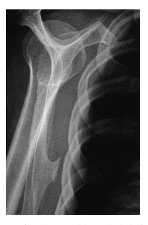
Fig. 1. — Radiographic image of the scapula clearly showing the osteochondroma in the inferior third of the scapula in the scapulothoracic articulation.

Clinical examination of the shoulder showed pseudo-winging of the scapula, indicative of a space-occupying lesion in the subscapular space. There was no clear atrophy of shoulder musculature. The shoulder had a full range of motion and normal stability. Scapulohumeral rhythm was disturbed due to pain as the patient guarded the scapulohumeral joint during elevation as a palpable and audible crepitus was observed. Palpation of the inferomedial corner of the scapula was tender. Standard radiographs showed an osteochondroma (fig 1). A computed tomography scan confirmed the diagnosis.