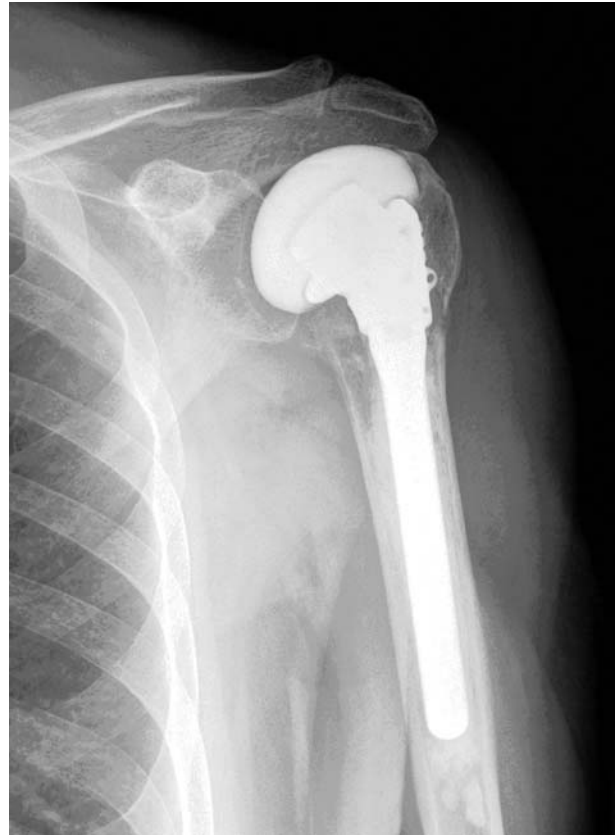
Fig. 2b. — Follow-up after 12 months with the tuberosities assessed as healed.

There are a few limitations to the study. First, this was not a multicenter study ; recruitment was limited and the number of patients was small, as in