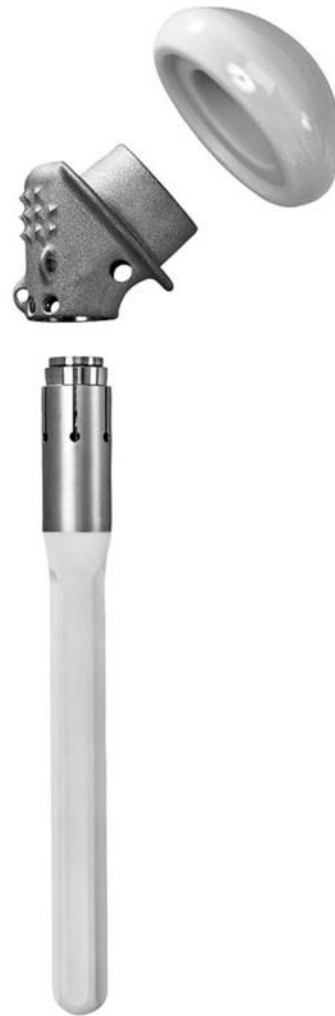
Fig. 1. — The ARTICULA® trauma shoulder prosthesis.

The degree of osteoporosis was judged intraoperatively by the surgeon and classified as severe, moderate or absent. Severe or moderate osteoporosis was noted intraoperatively in 58% and 34% of cases, respectively.