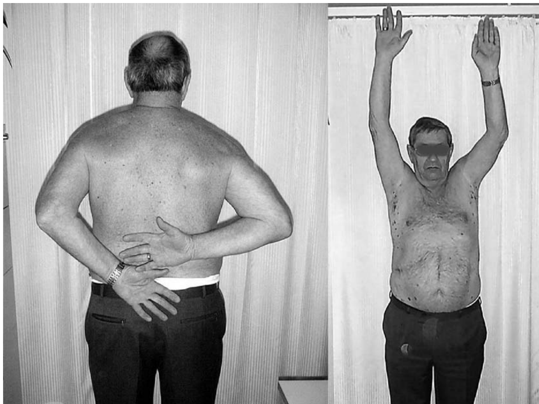
Fig. 2c. — Free range of motion for internal rotation and anteversion with a Constant Score of 81 points and an ASES Score of 87 points.

The strength of this study lies in its prospective nature and the fact that all patients have been operated on and followed-up according to the same criteria in the same centre.