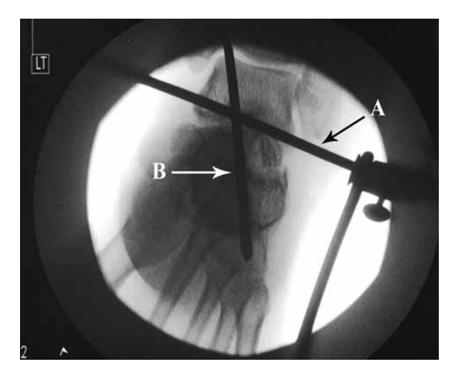
Fig. 1. — Intraoperative axial fluoroscopy view

With the patient in the supine position, the affected limb was prepped and draped from the knee down. A 1cm stab incision was made on the medial aspect of the calcaneus, just anterior to the insertion of the Achilles tendon. Blunt deep dissection was carried out carefully