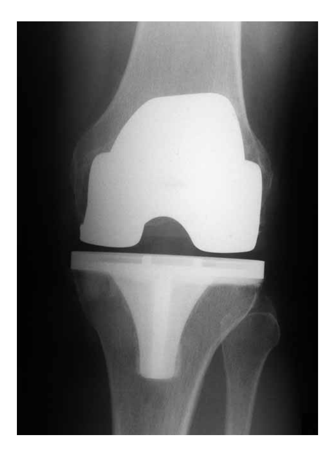
Fig. 1. —AP radiograph of PFC Sigma total Knee arthroplasty 6 weeks post-operatively.