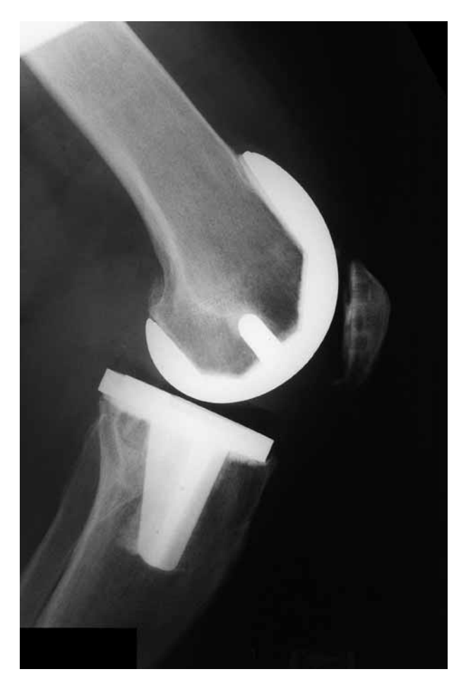
Fig. 4. — Lateral radiograph of PFC Sigma total knee arthroplasty after 8 years follow-up.