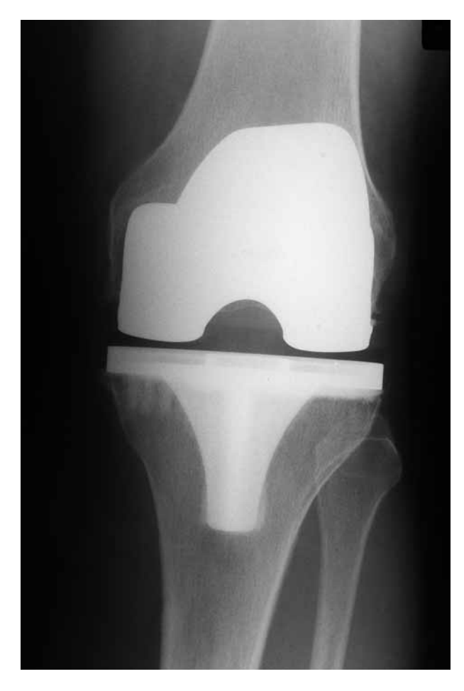
Fig. 3. — AP radiograph of PFC Sigma total knee arthroplasty after 8 years follow-up.