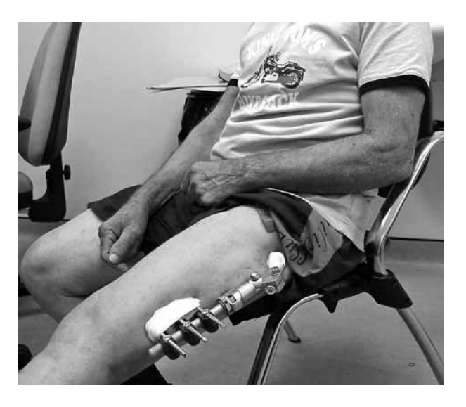
Fig. 2. — Sitting in a chair is possible with the Citieffe/Ch-N

Exclusion criteria were : a previous hip fracture, a fracture secondary to a malignant tumour, multiple fractures, chemotherapy and a body weight above 80 kg.