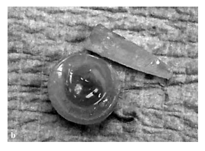
Fig. 2. — a) AP radiograph of a right elbow showing a fractured silastic radial head replacement; b) Resected silastic radial head replacement showing the intact prosthetic head and the fractured stem.

Besides breakage of the prosthesis (7, 9, 47, 49, 76, 85, 86), giant cell synovitis from silastic particles were shown to be a problem (27, 85, 95, 99). Results of clinical reports were mixed with some showing the silastic prosthesis to yield improved results over radial head resection (7, 21, 42, 80, 86), others showing no difference (23, 96, 97) or poor results following the use of the silastic prosthesis (24, 50, 56, 66, 76). Biomechanical studies showed that radial head replacements could restore some of the stability of the elbow (28, 33, 45, 64), and longitudinal stability of the forearm (13, 28, 32, 68), but that a stiffer implant would be necessary. Due to the abundance of objective data against the Swanson radial head prosthesis, new types of prostheses were developed (30, 38, 39, 46, 52, 53) and indications were again adjusted (56). Morrey et al (56) limited the indications for the use of a radial head implant to insta-