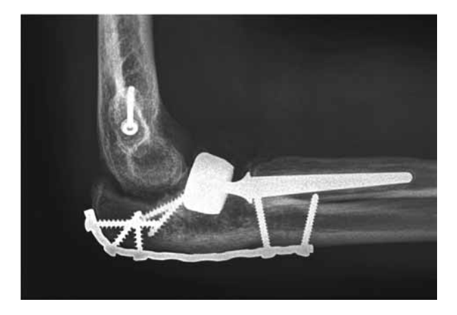
Fig. 3. — Lateral postoperative radiograph of a complex elbow reconstruction following trauma. The radial head was replaced with a 'floating radial head prosthesis' (Tornier SA, Saint-Ismier, France).

arm was still in a long arm cast. Another concern was degeneration and collapse of the graft that was found in follow-up radiographs (82). No long-term results were published.