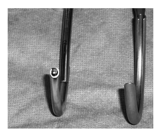
Fig. 1. — View from the tip end

Two different types of wire passers are generally available. In the first type the hole at the distal end of the passer faces away (wire passer on the left in fig 1 and on the right in fig 2) from the handle of the passer. In the second type it faces towards the handle (wire passer on the right in fig 1 and on the left in fig 2). No matter whether the distal end is inserted either from above or below the bone, if the first type of passer is used it is usually extremely difficult for the surgeon or the assistant to insert the wire or cable through the distal hole as it faces away from the surface of the bone and is usually covered by the surrounding soft tissues. This neces-