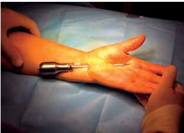
Fig. 2. — The palmar exit portal of the endoscopic carpal tunnel release (right).