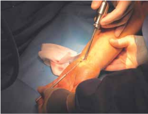
Fig. 1. — The entry portal for endoscopic carpal tunnel release.