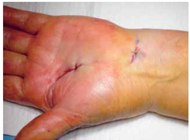
Fig. 5. — Only one suture is required per portal