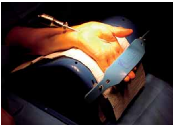
Fig. 3. — The hand is stabilised in the hand holder