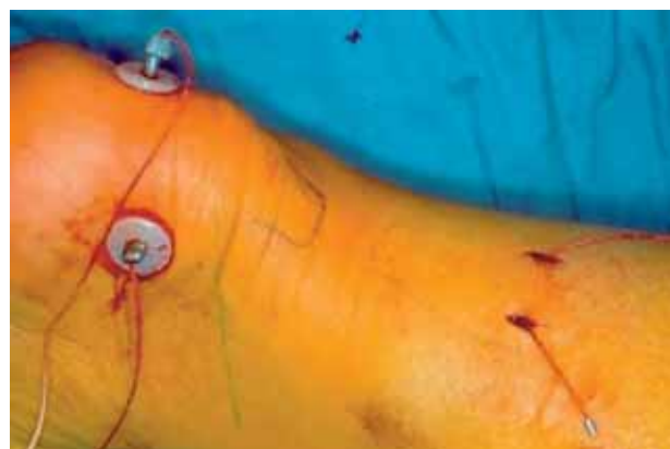
Fig. 3. — With the ankle in maximal plantar flexion both wires are brought under tension simultaneously and blocked by crushed lead balls over a washer.