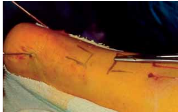
Fig. 2. — The two harpoons are introduced downwards in the proximal tendon end through two small incisions.