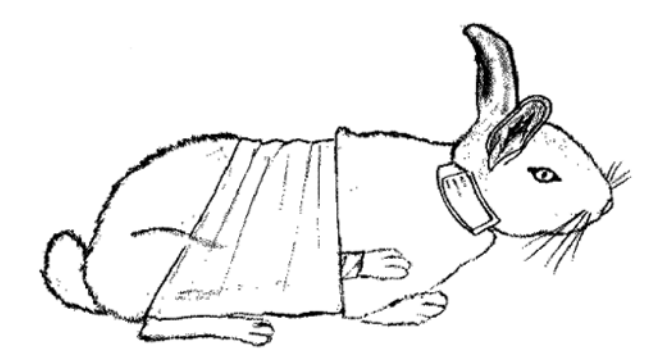
Fig. 1. — The fractured limb was fixed with gauze roll bandages, in both groups.

Twenty-four hours after the fracture, each rabbit was again given ketamin anaesthesia, and limb circumference and compartment pressure were measured as