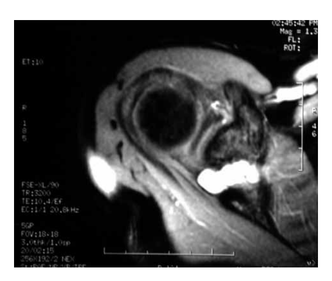
Fig. 3. — An MRI of a shoulder showing a ganglion cyst compressing the suprascapular nerve.

The patients were advised to take anti-inflammatories for two weeks, followed by an early rehabilitation programme starting 24 hours post-operatively. At a follow up of six months all were pain free, the scapular muscle contour had improved and shoulder abduction and external rotation strength returned to normal. All were able to return to the same level of sport as compared to the pre-injury level.