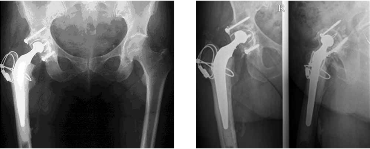
Fig. 2. — Initial postoperative radiograph (left) and follow-up radiograph more than 15 years after surgery (right) of a flanged cup fixed with hydraulic pressurisation cementing technique.

noted 22% acetabular loosening with 12% revision at 15 years. Recently Callaghan et al (2) described the thirty years follow-up results of 27 patients and 34 hips, representing 10.3% of the initial study group, still alive at least 30 years after THA. Twenty-three hips or 7.3% of the initial study group had revision because of aseptic loosening of the acetabular component. In our series we had not one hip revised because of aseptic loosening. The hydraulic pressurisation cementing technique may well be responsible for an improved cement interdigitation with the subchondral trabecular bone.