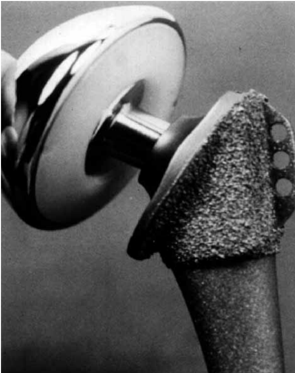
Fig. 1. — The Biomet bipolar shoulder replacement consists of a birotational head that allows movement at the intraprostatic interface and also between the shell and glenoid.

acromion and allowing the cup to align itself within the glenoid (10).