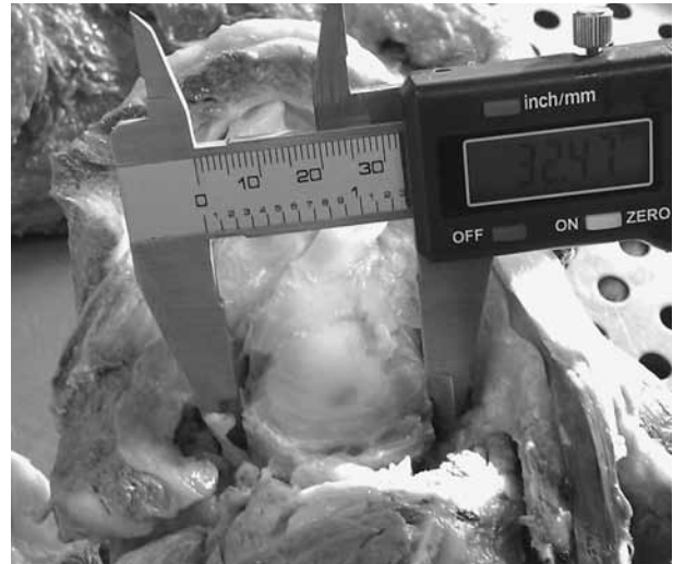
Fig. 2. — Caliper measurement of the AP dimension of the glenoid.

The measurements were made by three investigators separately. Two of these investigators were last year