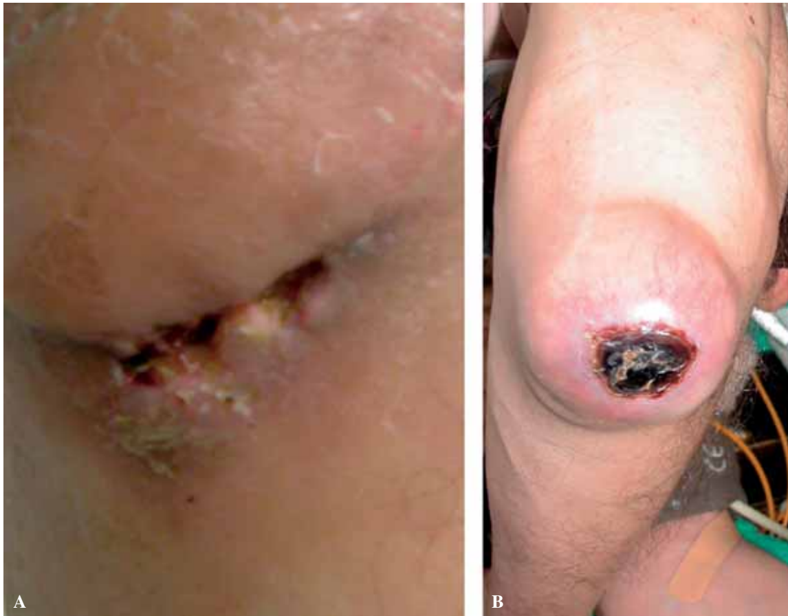
Fig. 1. — Examples of prolonged wound draining (A) and skin necrosis (B) after olecranon bursectomy

at 2, 4 and 12 weeks postoperatively. Attention was set on wound healing problems (haematoma, prolonged exudation, skin necrosis) and recurrence.